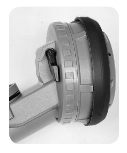
Fig. 9 Positive pressure switched off