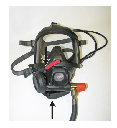
Fig. 6 Activated positive pressure