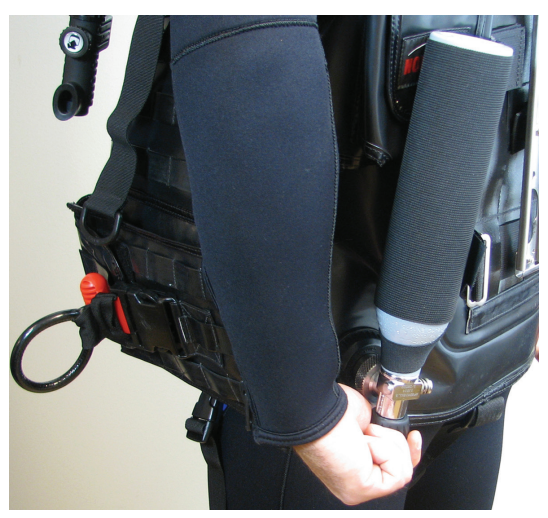
Note: The vest will inflate until the vest is filled. All excess air from the rescue air inflation cylinder will be exhausted through the dump valves.

• Open the rescue air inflation cylinder on the left back side of the vest to inflate the vest with air.